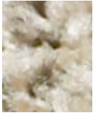
00100 WHITE WASH